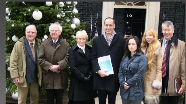
Photograph taken at Number 10 Downing Street, London

The RRT gained charitable status in 2003 and is supported by MPs and MEPs from the UK political parties. We are also indebted to Independent Scientific, Public Health and Technical Advisors.